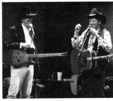
Ray Wylie Hubbard and Jerry Jeff perform together at the Paramount Theatre during the '93 Birthday Bash.