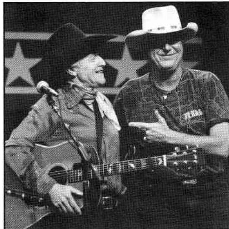
Jerry Jeff is joined onstage at his annual Birthday Concert at the Paramount Theatre in Austin by the legendary Ramblin' Jack Elliott.

'95 was a wild Birthday Bash here in Austin...Non-stop