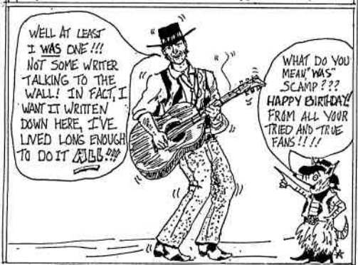
FROM THE SONG "ROCK AND ROLL MY BABY" OFF "HILL COUNTRY RAIN" RELEASE. WRITTEN AND PERFORMED BY JERRY JEFF WALKER. © DAVID DAVIES '93 FOR TRIED AND TRUE MUSIC.

SEE INSIDE FOR FULL BIRTHDAY '93 INFO, AND NEW T&TM SPECIAL EVENTS!